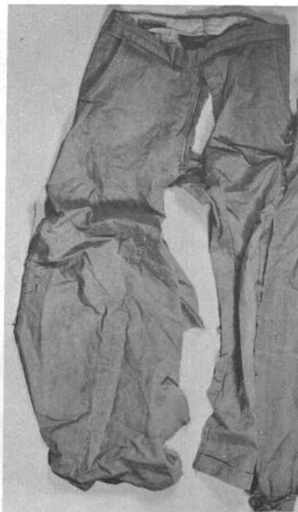
COMMISSION EXHIBIT 157