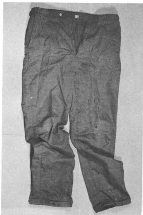
COMMISSION EXHIBIT 156