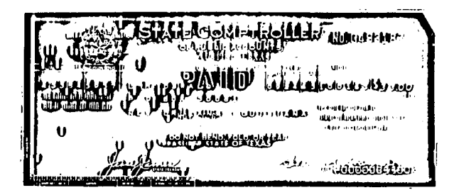
Commission Exhibit No. 3121