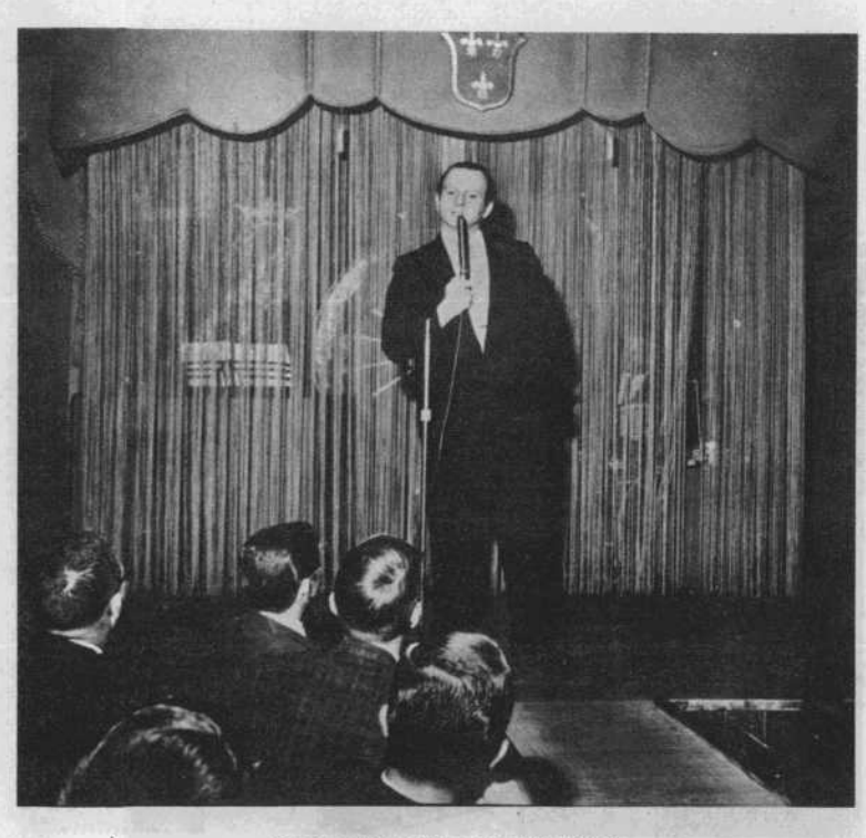
Commission Exhibit No. 2425