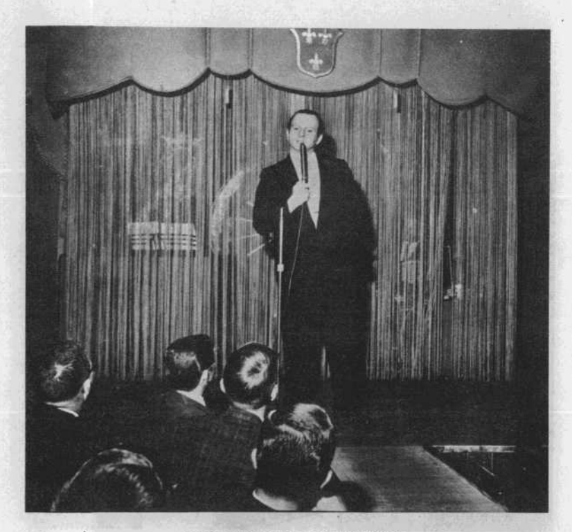
COMMISSION EXHIBIT No. 2425