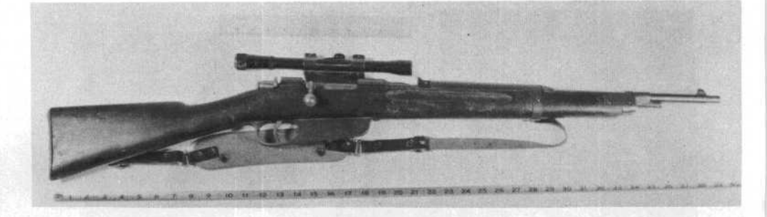
COMMISSION EXHIBIT No. 1303