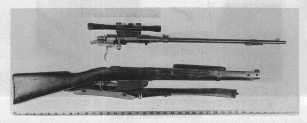
COMMISSION EXHIBIT No. 1304—Continued