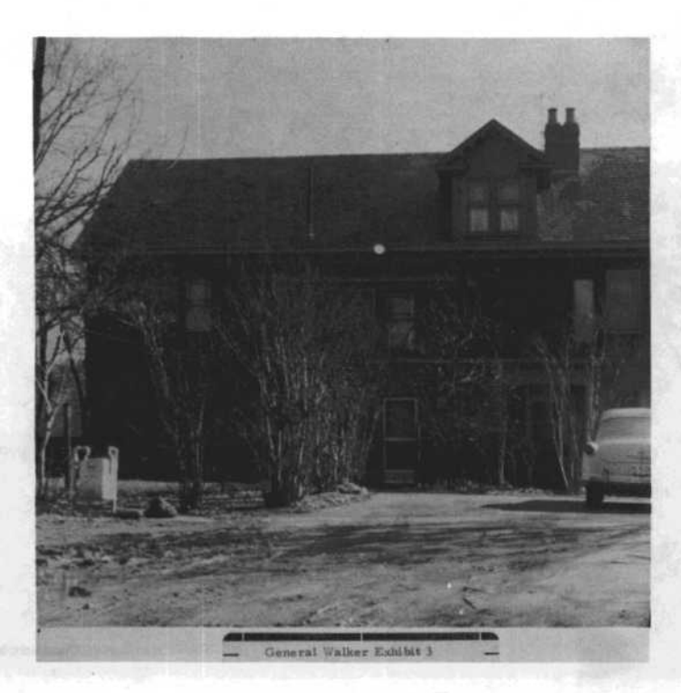
WALKER (EDWIN A.) EXHIBIT No. 3