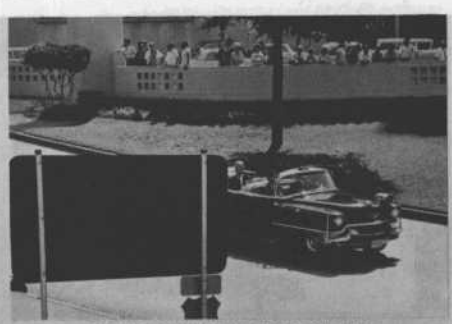
PHOTOGRAPH FROM RE-ENACTMENT