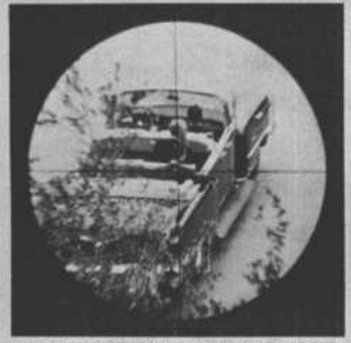
PHOTOGRAPH THROUGH RIFLE SCOPE