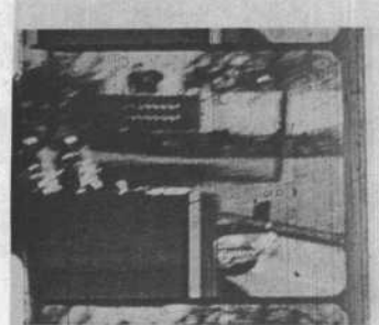
PHOTOGRAPH FROM ZAPRUDER FILM