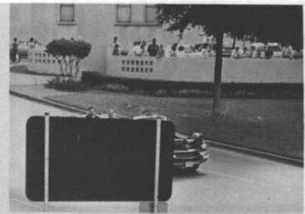
PHOTOGRAPH FROM RE-ENACTMENT