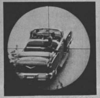
PHOTOGRAPH THROUGH RIFLE SCOPE