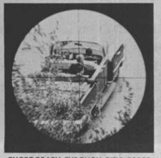
PHOTOGRAPH THROUGH RIFLE SCOPE