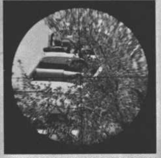
PHOTOGRAPH THROUGH RIFLE SCOPE