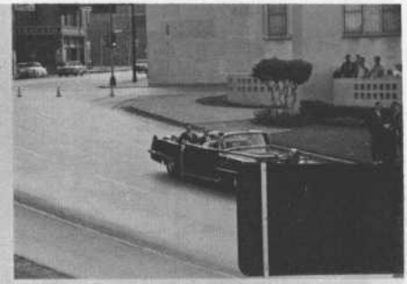
PHOTOGRAPH FROM RE-ENACTMENT