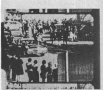
PHOTOGRAPH FROM ZAPRUDER FILM