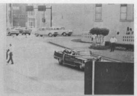
PHOTOGRAPH FROM RE-ENACTMENT