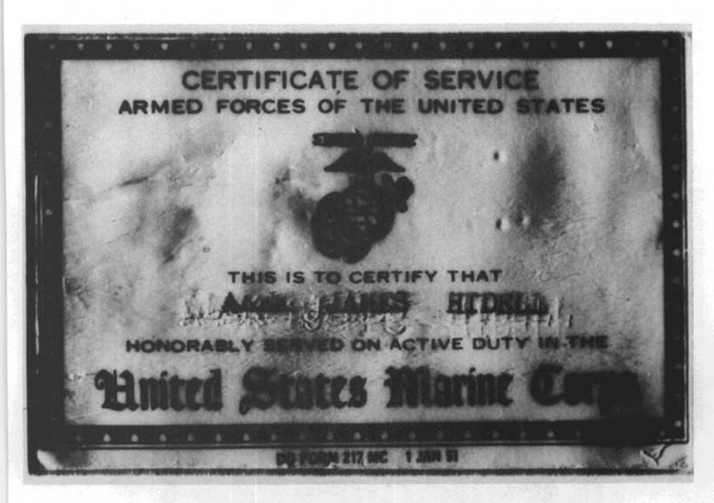
COMMISSION EXHIBIT 809