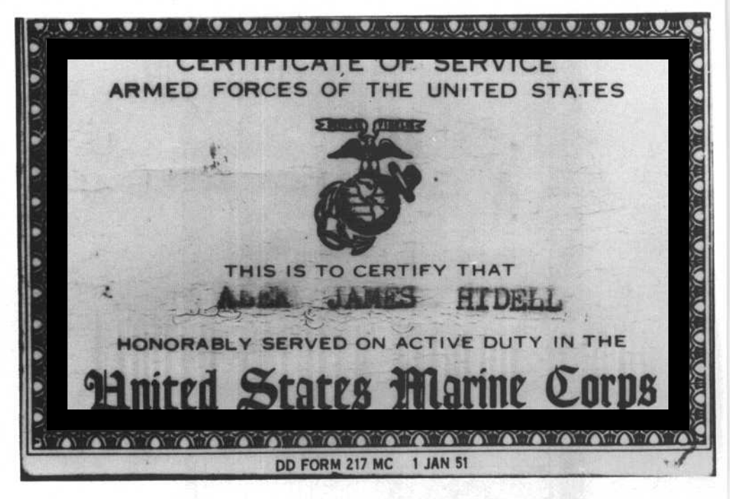
COMMISSION EXHIBIT 807