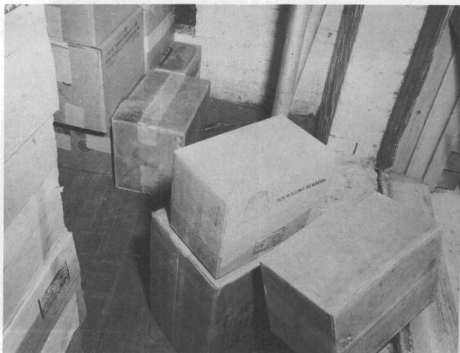
COMMISSION EXHIBIT 733