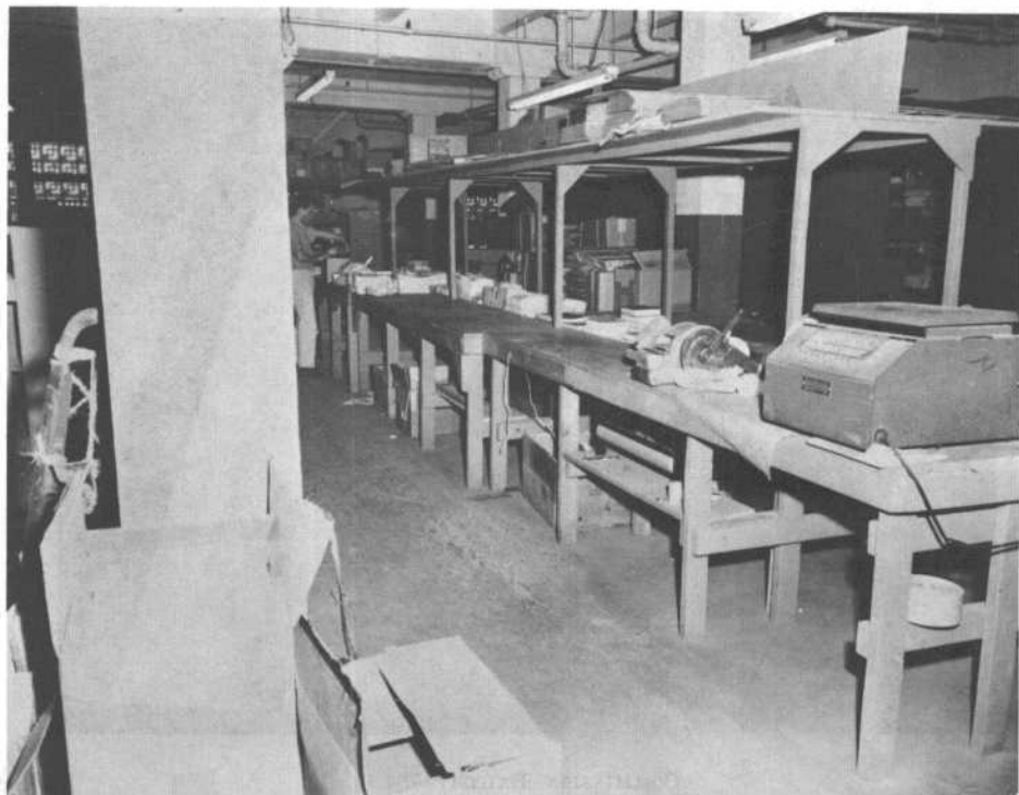
COMMISSION EXHIBIT 732 - 1071a