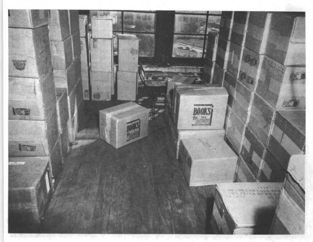
COMMISSION EXHIBIT 728