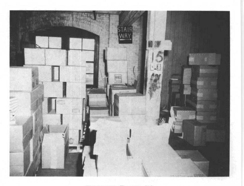
COMMISSION EXHIBIT 719