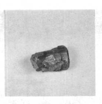
COMMISSION EXHIBIT 605