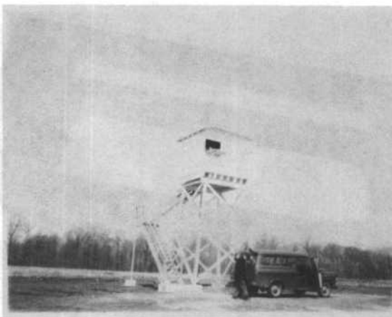
COMMISSION EXHIBIT 579