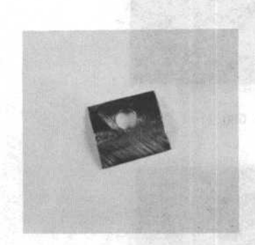
COMMISSION EXHIBIT 576