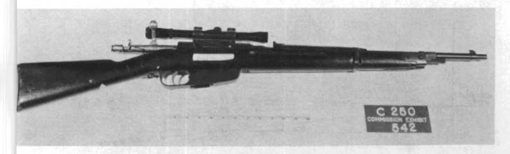
COMMISSION EXHIBIT 542