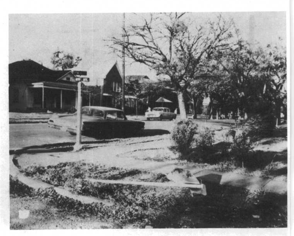
COMMISSION EXHIBIT 528