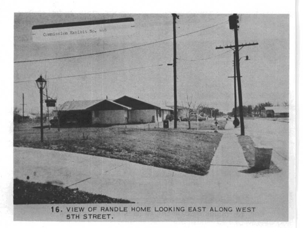
COMMISSION EXHIBIT 448