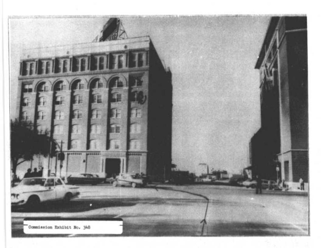
COMMISSION EXHIBIT 348