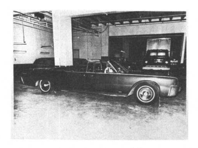
COMMISSION EXHIBIT 344