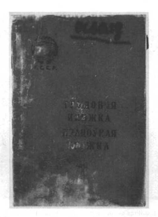
Right upper corner, written by hand: "OSWALD" Upper left: State Emblem of the USSR WORK BOOK (This is repeated in Belorussian)