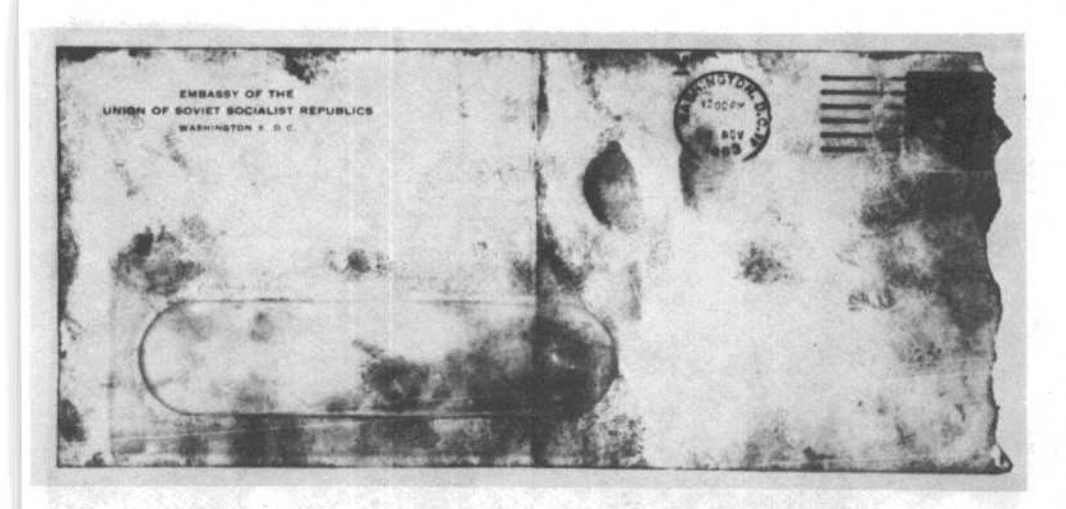
COMMISSION EXHIBIT 19