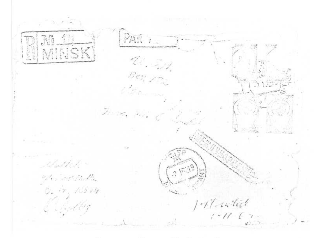
Commission Exhibit 189—Continued