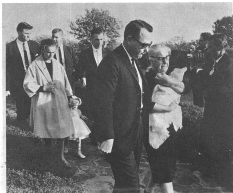
COMMISSION EXHIBIT 174