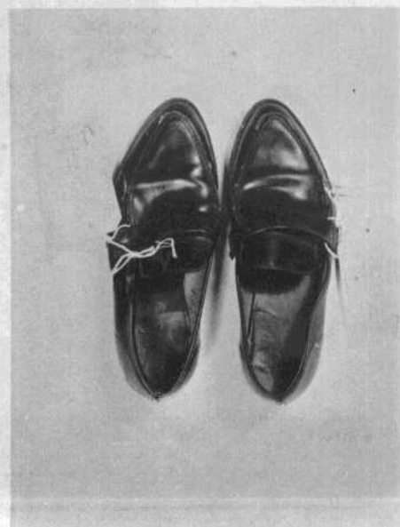
COMMISSION EXHIBIT 149