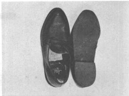
COMMISSION EXHIBIT 147