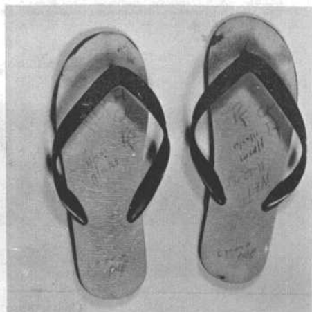
COMMISSION EXHIBIT 148