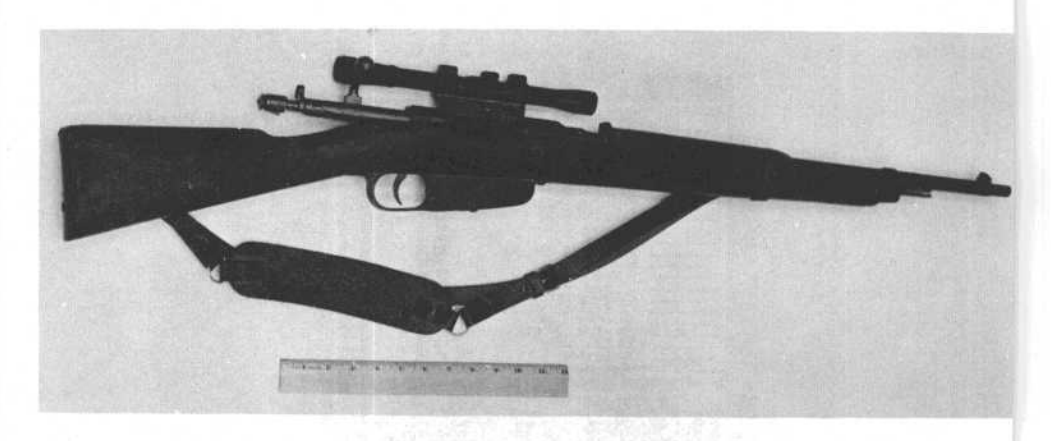
COMMISSION EXHIBIT 139