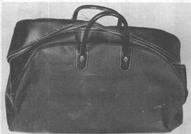
COMMISSION EXHIBIT 126