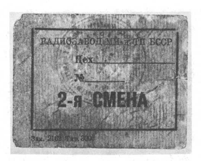
Document with Russian writing: "2—CMEHA": "2nd Shift,"