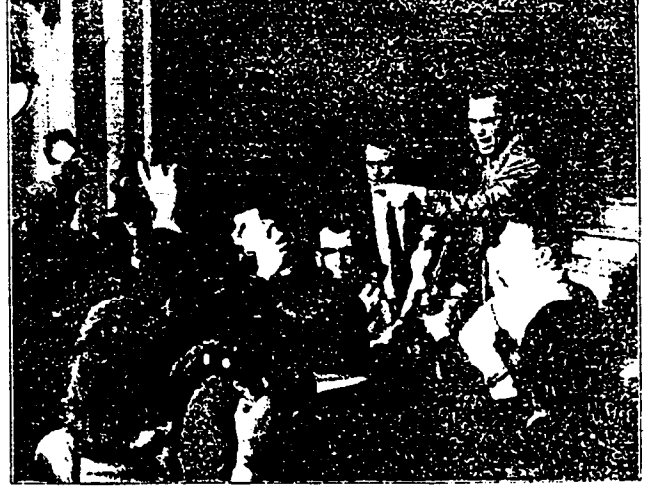
In the film JFK , Jim Garrison (Kevin Costner) is confronted by reporters about his theory of the Kennedy assassination